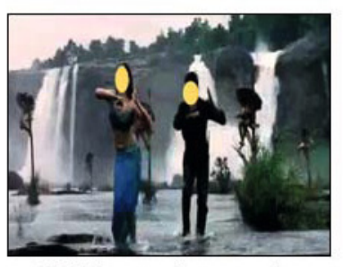
GT: Person dances rain. SAT: Person dances group. RF: Person does hair. SVM: Person kicks video.