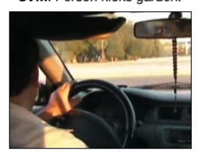
GT: Person drives car. SAT: Person rides car. RF: Person moves bicycle. SVM: Person does pool.