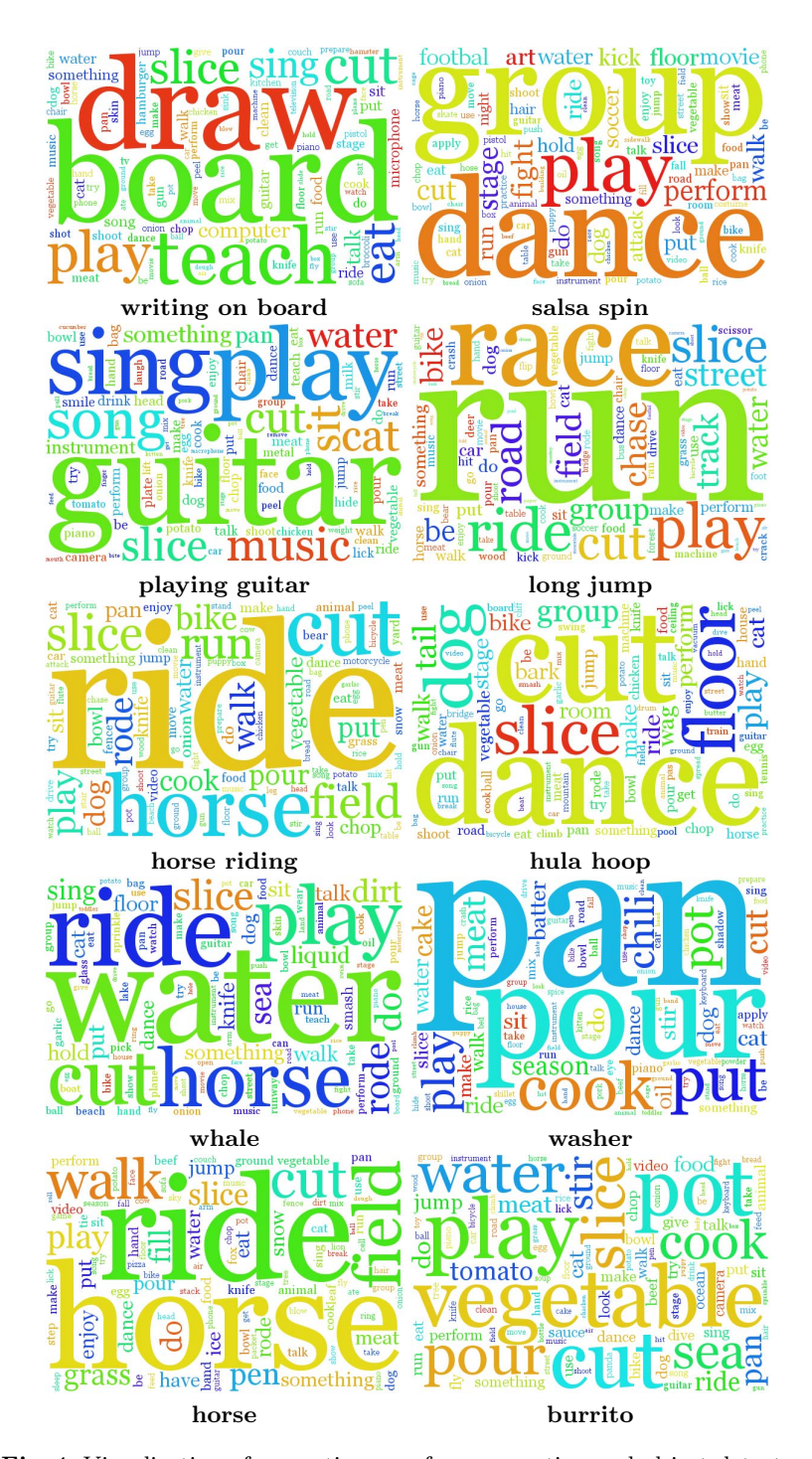
Fig. 4. Visualization of semantic maps for some action and object detectors