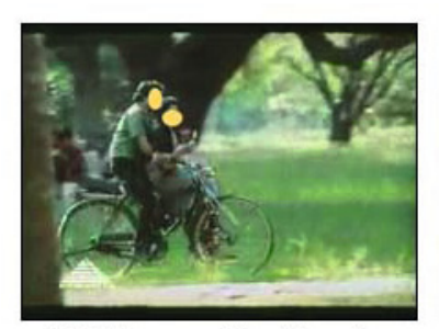
GT: Person rides bicycle. SAT: Person rides bicycle. RF: Person tries ball. SVM: Person rides bicycle.