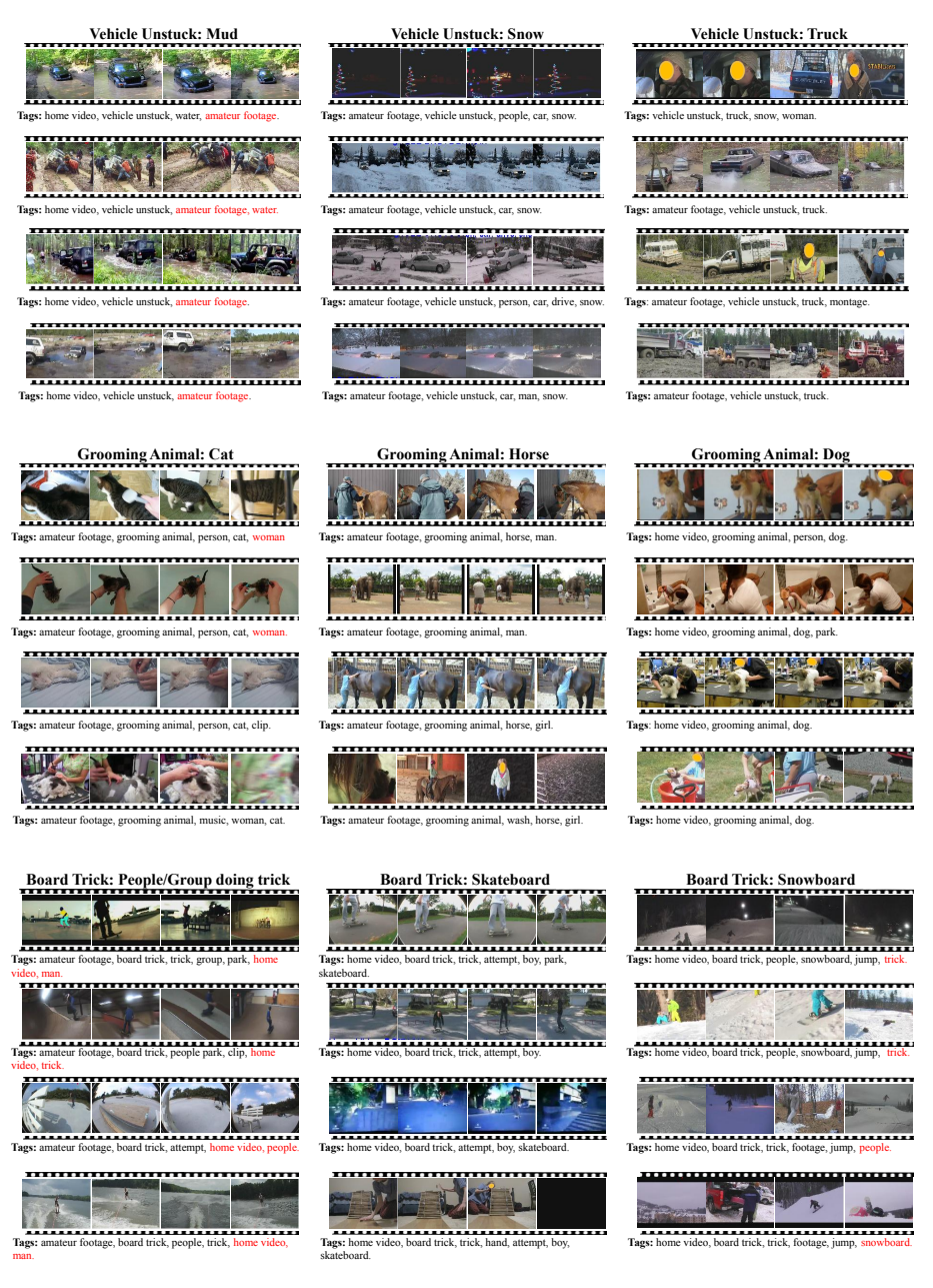
Fig. 2. Qualitative visualization of sub-categories discovered from event categories in TRECVID MED 2011 dataset. Each row represents three sub-categories of an event category. For each sub-category four highest-scored videos are visualized. The tags associated for each video is also reported along with red tags added by Flip MMC. In most cases the formed clusters represent a semantically meaningful sub-category. The semantic content of each cluster can be extracted by manually checking common detected tags, and is reported on top.