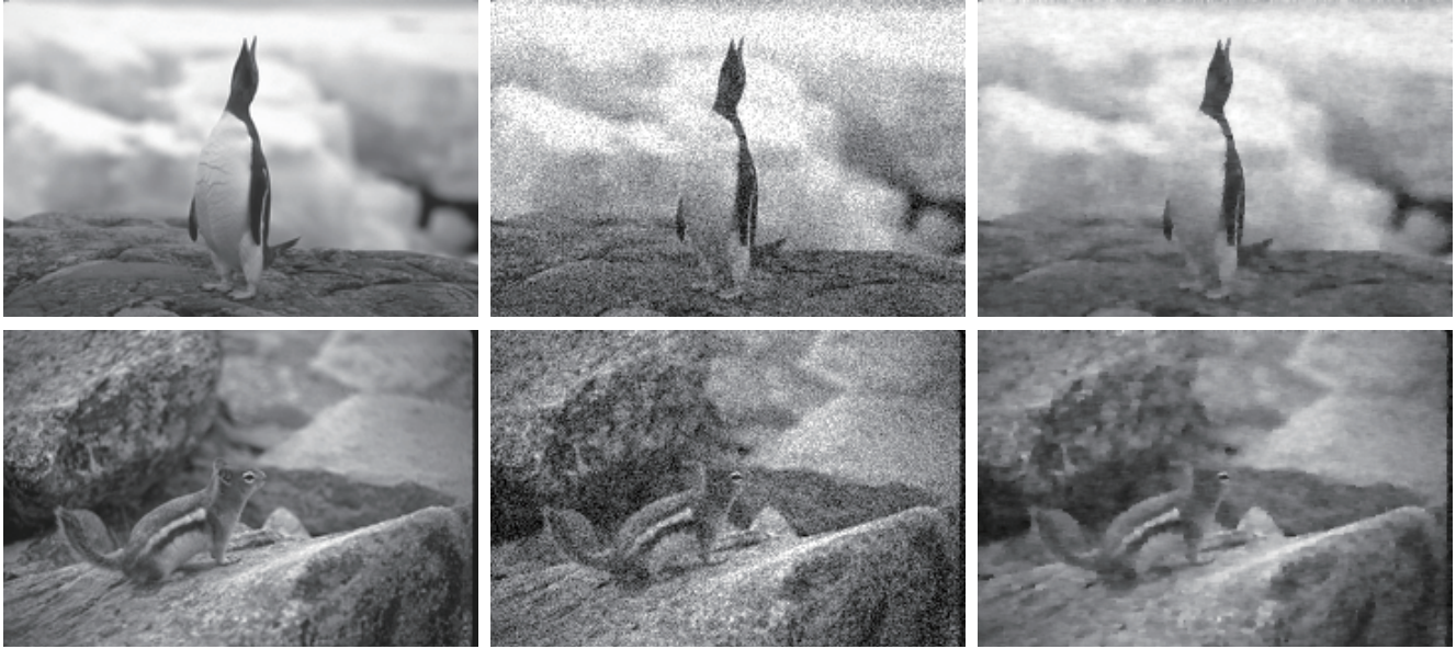
Figure 2. More image restoration results. (Left column) Original images. The size is 240 \times 160 pixels. (Middle column) Noisy images ( \sigma = 20 ). PSNR=22.63 and 22.09 from top to bottom. (Right column) Restored images. PSNR=30.92 and 28.29 from top to bottom.