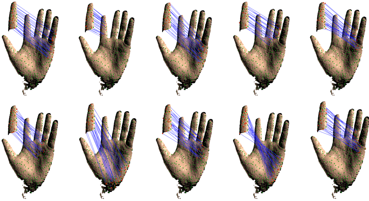
Figure 1. First 10 solutions of a finger-hand matching. Because of its almost flat surface and not all the fine details (finger prints, palm lines) presented in the scanned data set, our algorithm matches the finger to different position inside of the palm.