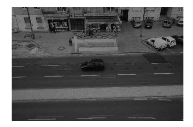
Fig. 3. Low-light scenes lead to video sequences with very low contrast between moving objects and background.

P. Aguiar, R. Jasinschi, J. Moura, and C. Pluempitiwiriyawej, "Content-based image sequence representation," in Digital Im age Sequence Processing, Compression, and Analysis , Todd Reed, Ed. CRC Press, 2004.